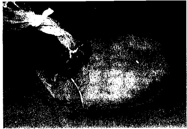
Fig 4. Staged reduction of transparent silo.

None of the 10 babies treated with staged silo closure had sepsis.