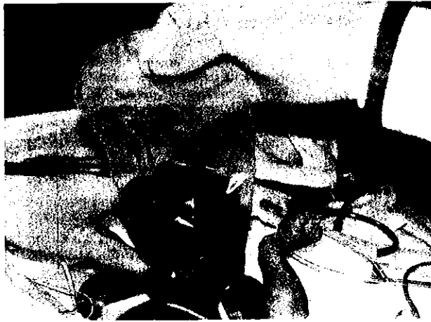
Fig 2. Gastrochisis before silo insertion.

until toleration of full-volume oral feeding, and time until discharge. There was no significant difference in parameters except with respect to time until closure in the primary closure group (Table 1).