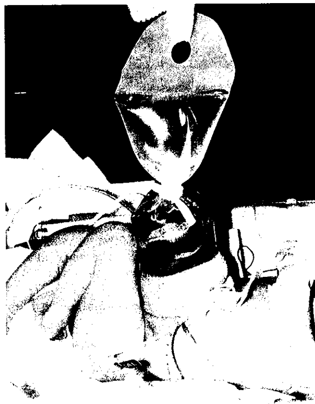
Fig 3. Gastrochisis with silo in place.

There were no cases of necrotizing enterocolitis in the children treated by staged silo closure. Three children with staged silo closure had localized cellulitis that resolved with antibiotics and wound care.