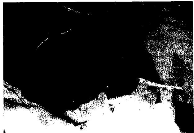
Fig 5. Final result after fascial closure.

Some surgeons advocate using intraoperative measurements of intragastric and central venous pressure to determine the feasibility of primary closure. 8 However, this can be subjective and has not gained widespread acceptance. Staged closure can alleviate some of the problems of bowel compromise but entails a trip to the operating room and a sutured silo, which can result in disruption or sepsis. 9